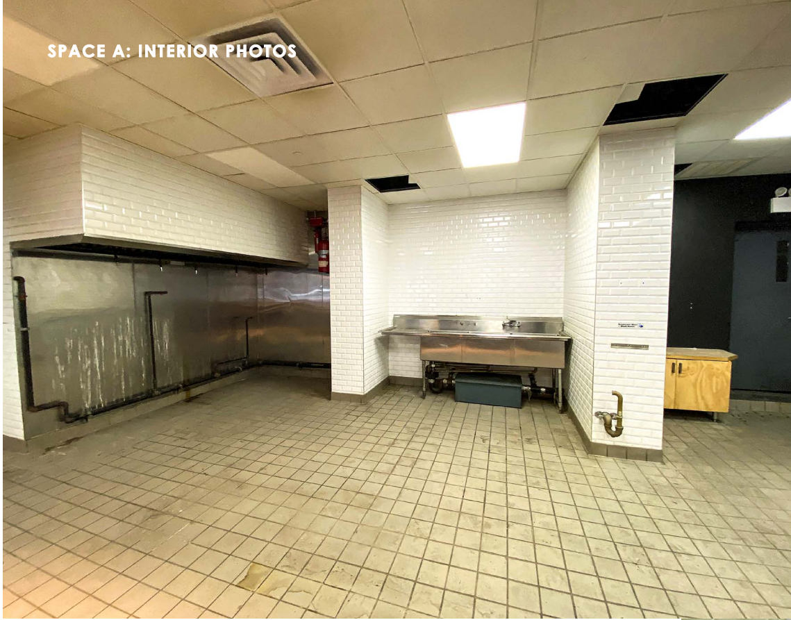
SPACE A: INTERIOR PHOTOS