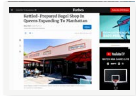
Kettled-Prepared Bagel Shop In Queens Expanding To Manhattan