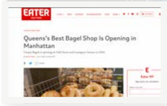
Queen's Best Bagel Shop is Opening in Manhattan