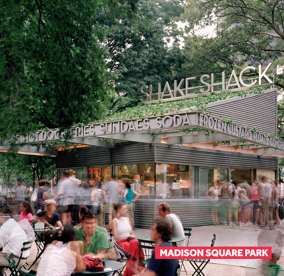
MADISON SQUARE PARK